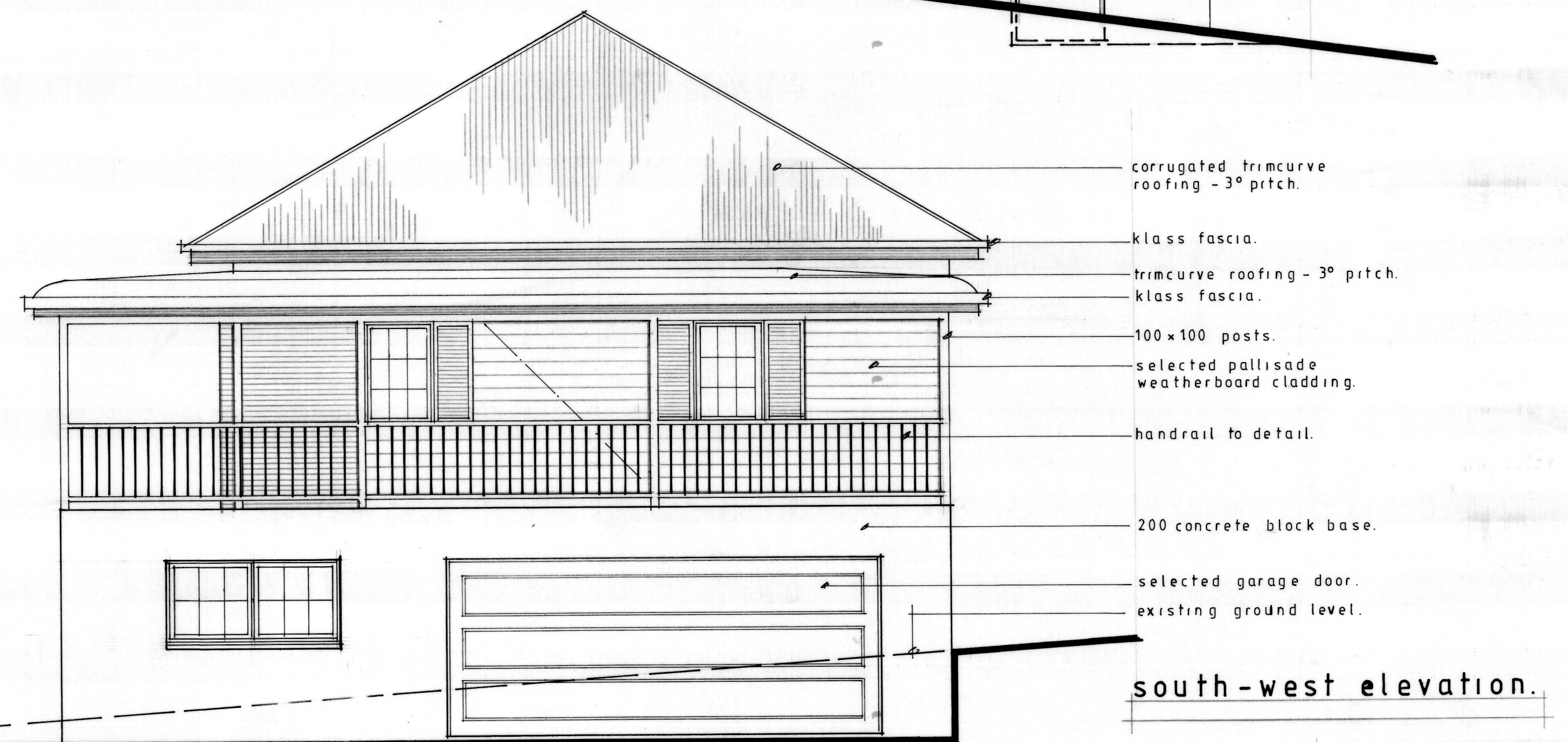
south - west elevation.