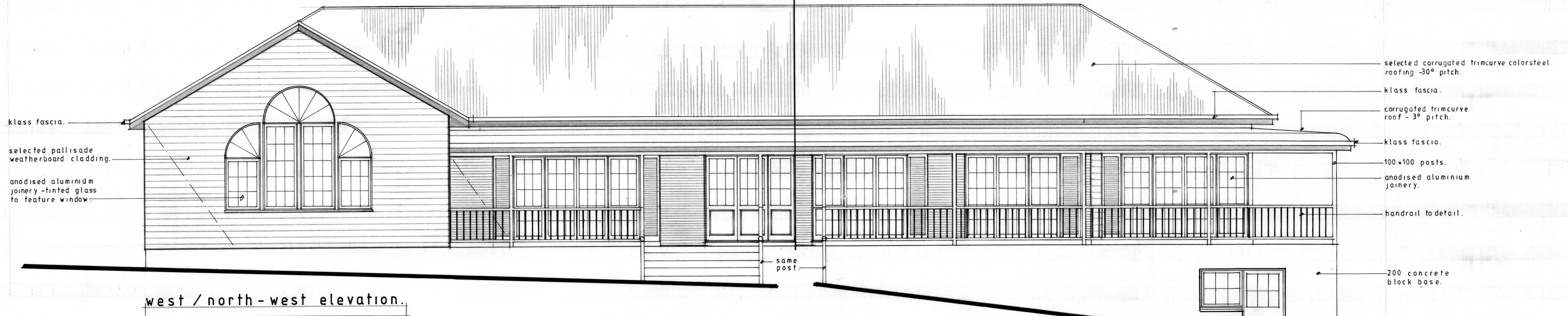
west / north - west elevation.