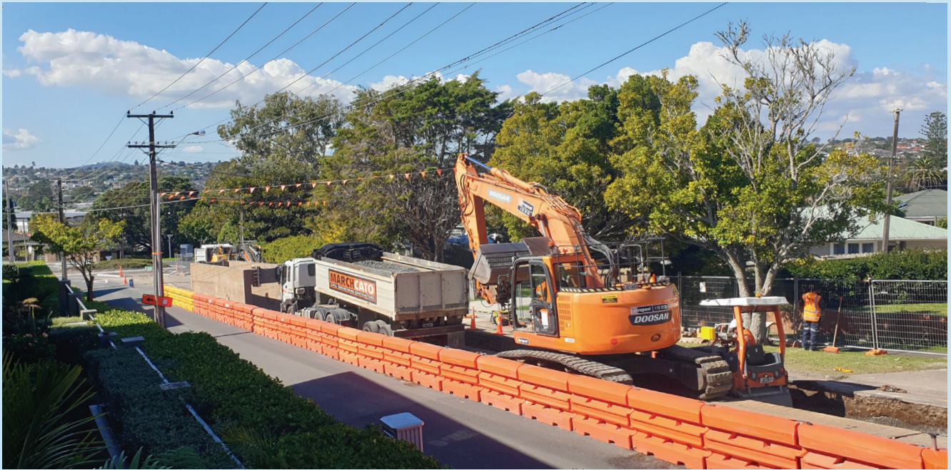
Pipeline trenching taking place on Golf Road section of the replacement Huia no.1 watermain.