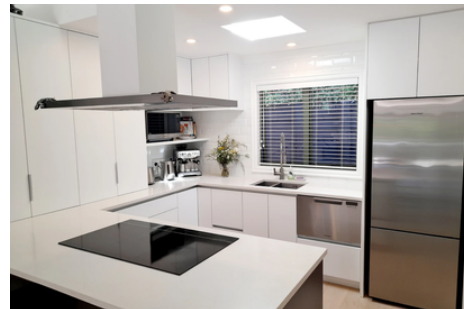
33 Laingholm Drive, Laingholm - $650.00