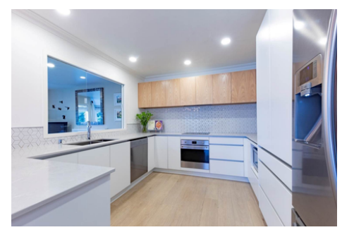
244 Konini Road, Titirangi - $1000.00