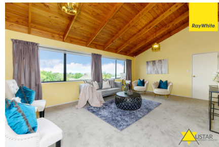
37 York Road, Titirangi - $800.00