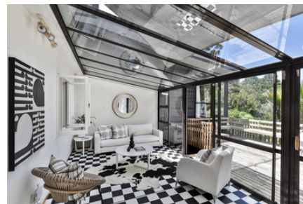
108 Atkinson Road, Titirangi - $780.00