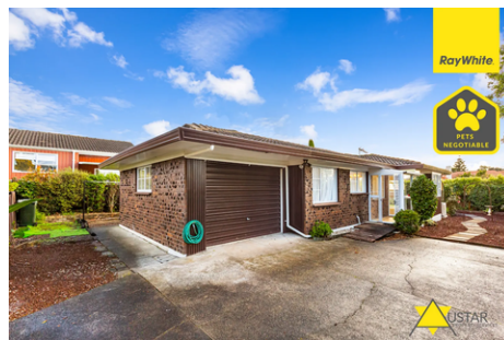
26 Caspian Close, New Lynn - $680.00