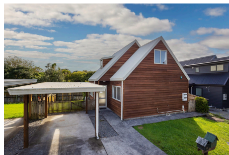
45C Veronica Street, New Lynn - $700.00