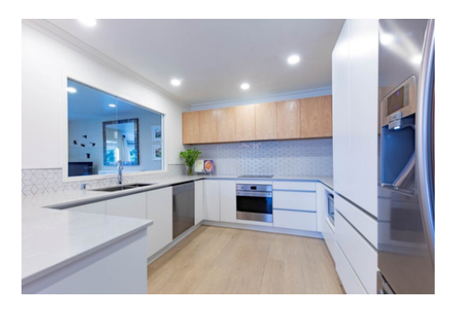
2 Okewa Road, Titirangi - $1300.00